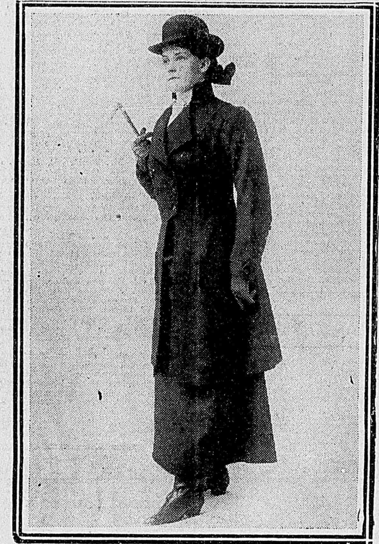
A DIRECTOIRE RIDING HABIT.