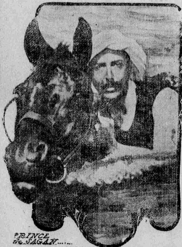
PRINCE DE SAGAN, COUNT BONI'S RIVAL.