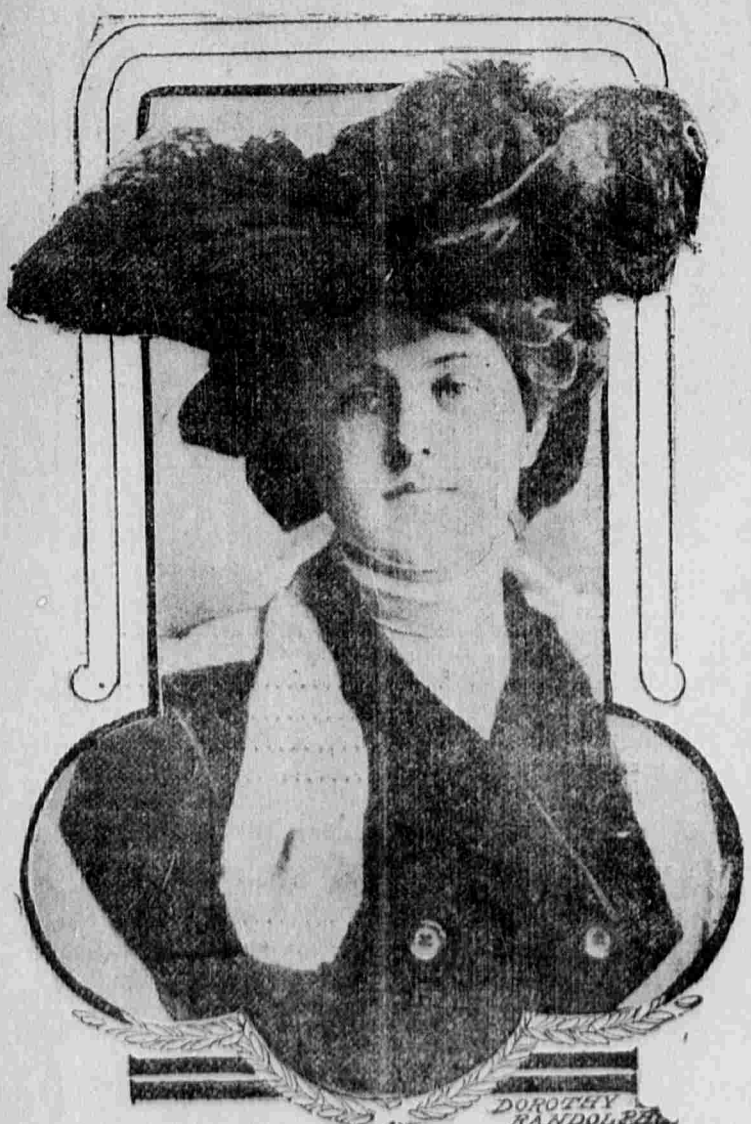
FAMOUS BUTTERFLY DANCE OUTDONE.

Americans do not like rough-and-tumble fighters any more than other refined people, do, but the whole country is still in a broad grin of undisguised enjoyment over the exploit of those two funny little men, Count Boni de Castellane and his cousin, Prince Helle de Sa gan in punning each other on the steps of a church in Paris. That Boni should spit in the prince's face on the church steps, and that the Prince should retaliate by a slap on the wrist, which atrocious assault was followed by a clinch that carried the fighters into the gutter, seems perfectly natural to those acquainted with the comical noblemen. The harmless European duel, at which both prince and count are experts, was the proper sequence to the expectation and the slapping. Now the prince has added to the hilarity by suing the count for 20 cents, just 10 cents less than even the most radical American ever appraised as the probable worth of either.