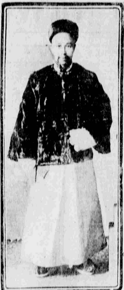
KANG YU WEI.

Very easy and so easy to take as sugar. CARTER'S LITTLE LIVER PILLS. FOR HEADACHE. FOR DIZZINESS. FOR BILIOUSNESS. FOR TORPID LIVER. FOR CONSTIPATION. FOR SALLOW SKIN. FOR THE COMPLEXION. CURE SICK HEADACHE.