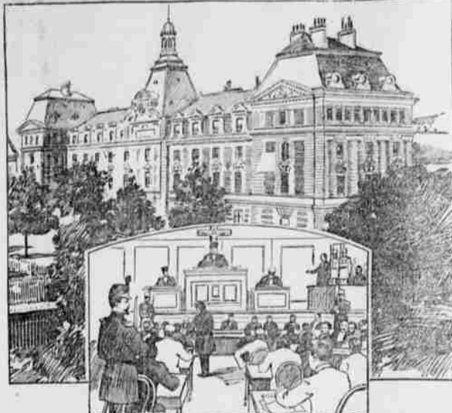
SCENE OF THE DREYFUS COURT MARTIAL

Victim Uttered a Cry as He Fell—An Eye-Witness Describes the Shooting—Men Lay in Ambush.