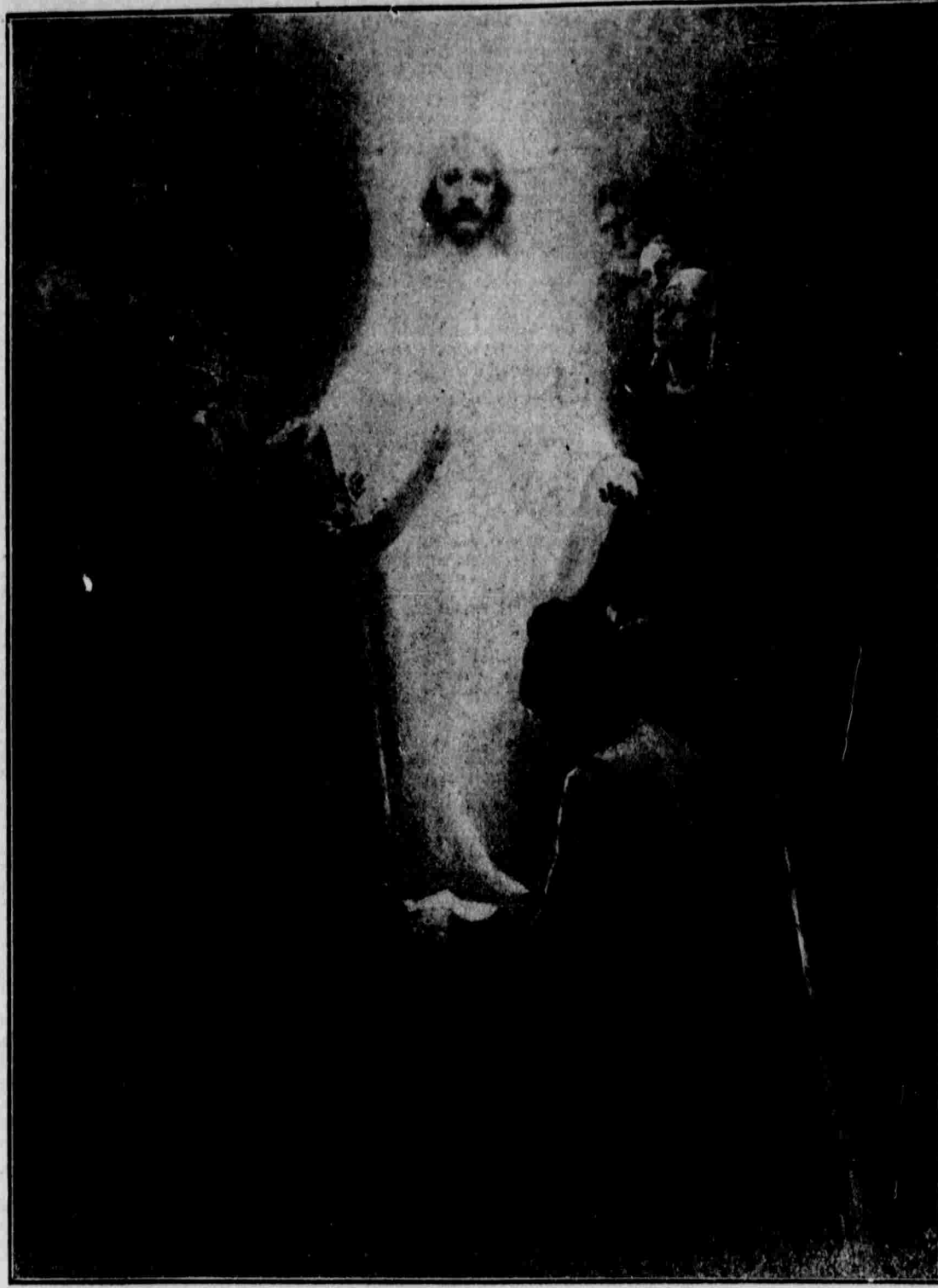
"THE ADORATION OF AGES."