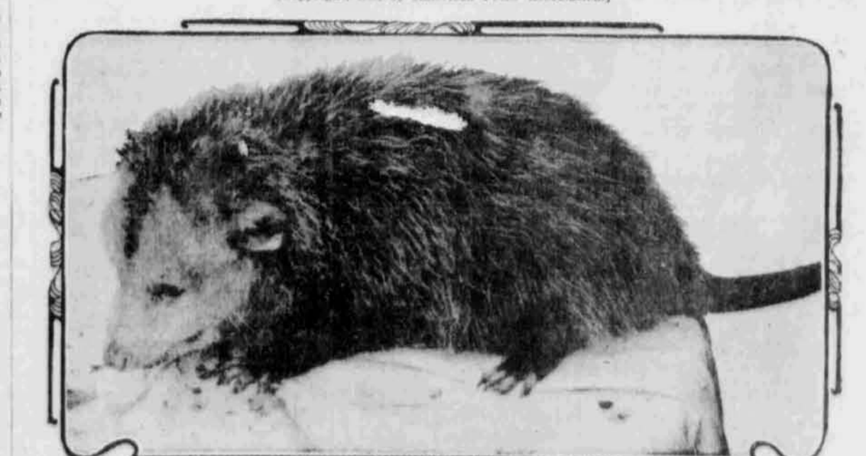
THE THANKSGIVING BILLY POSSUM