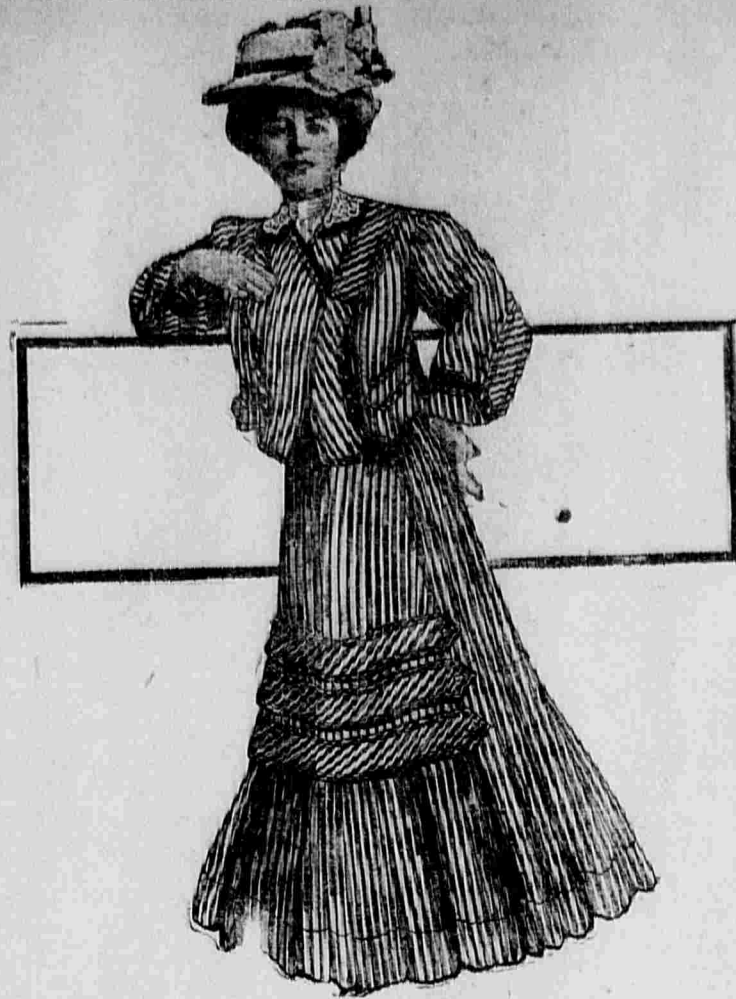
A NOBBY PONETO COAT SUIT.