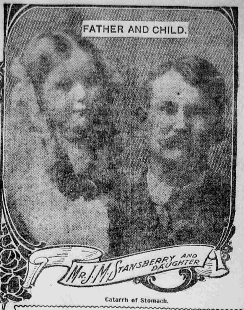
FATHER AND CHILD.

"On December 2, 1899, I was injured by a fall on the Santa Fe R. R., and my entire nervous system was impaired by the same. The help of a physician was useless. I believe I tried every one in the vicinity, but all were alike and I