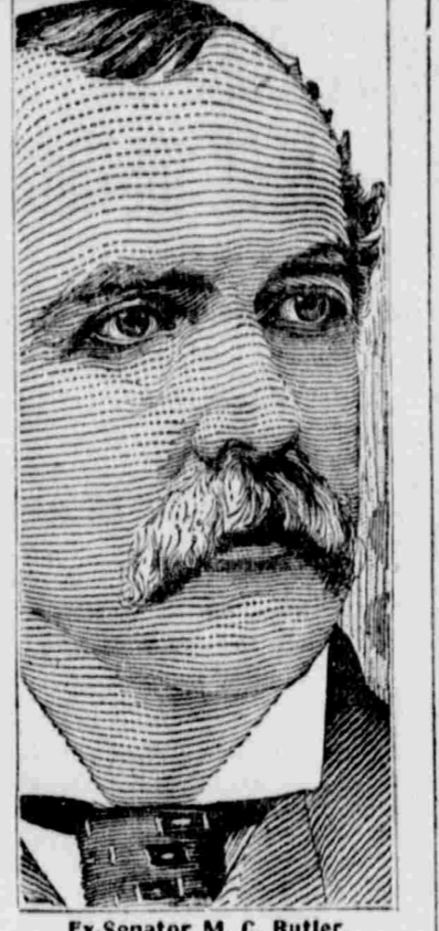
Ex-Senator M. C. Butler.

Dyspepsia is Often Caused by Catarrh of the Stomach—Peruna Relieves Catarrh of the Stomach and is Therefore a Remedy For Dyspepsia.