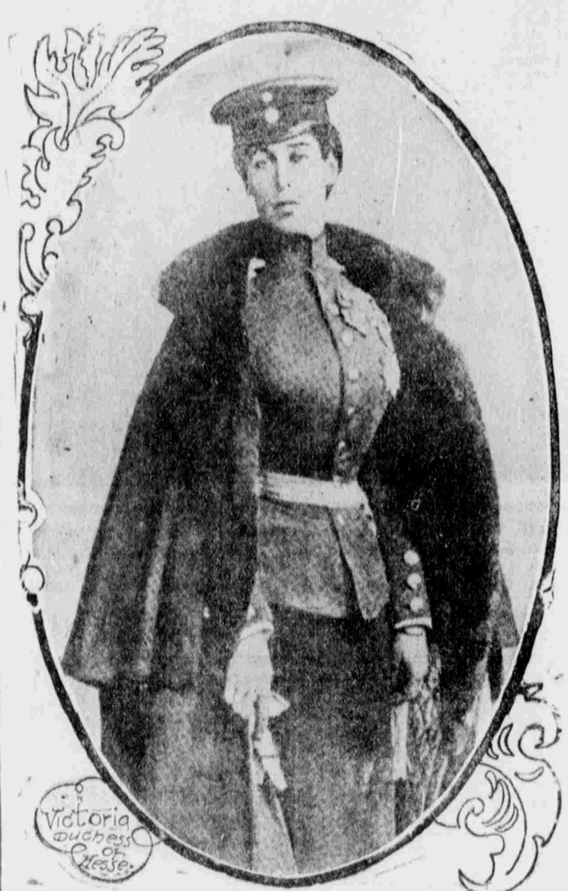
FORMER GRAND DUCHESS OF HESSE.

The marriage was formally announced of the Grand Duke Cyril of Russia and Princess Victoria Melita, Oct. 8, at Tegernsee, Upper Bavaria, according to the Russian rites. An imperial ukase dismisses Grand Duke Cyril from the service in consequence of his recent marriage to the Princess Victoria, the divorced wife of the Grand Duke of Hesse. The ukase also deprives the grand duke of his decorations and other honors. The marriage is the outcome of a long romance, for the two cousins are known to have been devoted to each other from childhood.