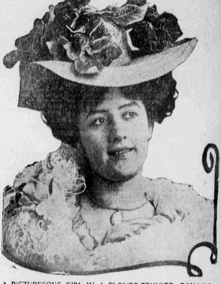
A PICTURESQUE GIRL IN A FLOWER-TRIMMED PANAMA.

Princess Waldemar of Denmark is greatly interested in the firemen of Copenhagen, and shows it in so practical a way that they all adore her and