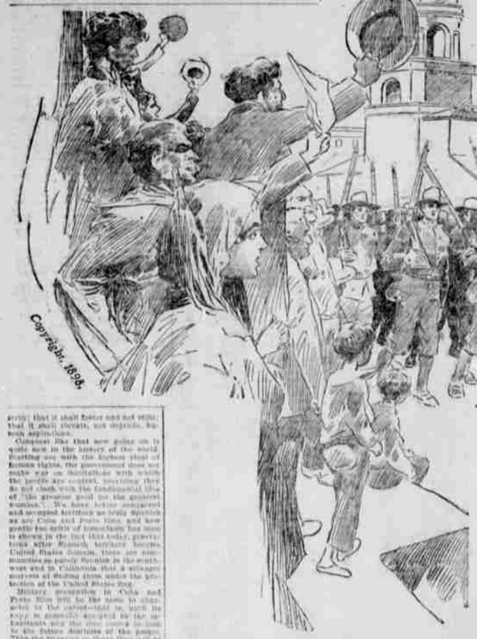
PORTO RICANS WELCOMING OUR TROOPS.

There are considered the best governed territories in America. If some of our cities should become a little worse governed than they are today, it will be a great improvement. It is in the hands of the military rule, and it is in the hands of the military rule, and it is in the hands of the military rule.