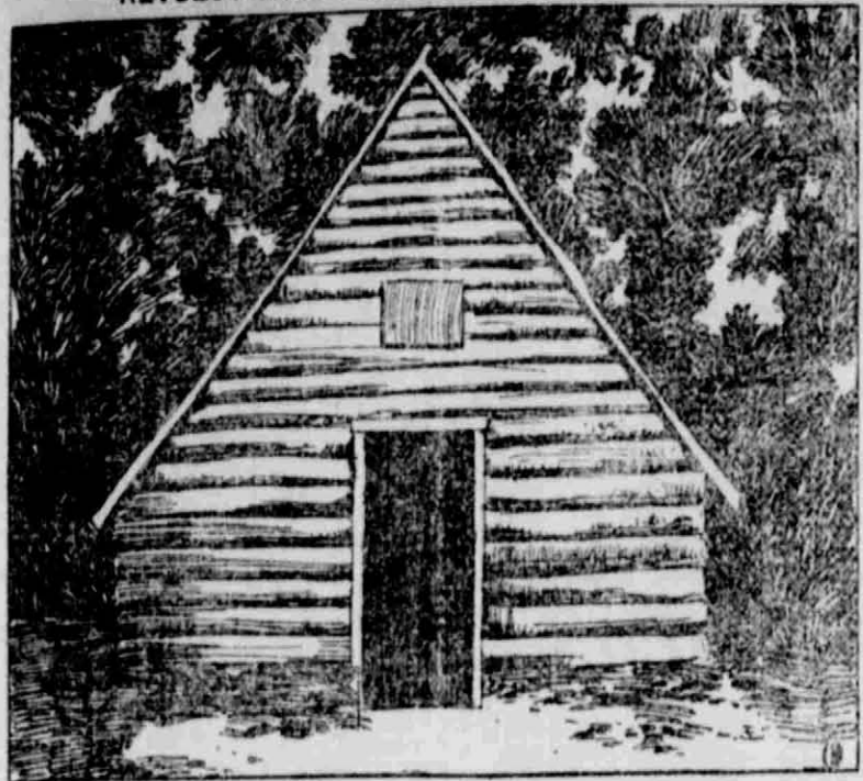
The log hut shown herewith is one of the restorations made recently at historic Valley Forge. The work was done under the auspices of the Daughters of the Revolution.