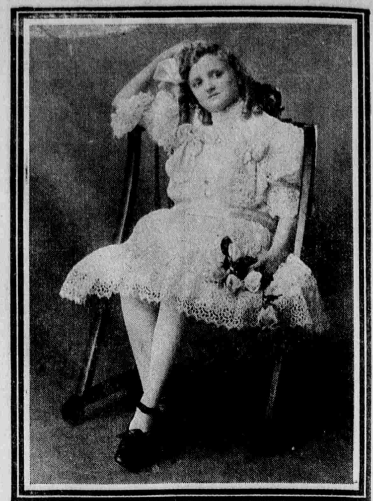
HER BEST EMBROIDERY FROCK.