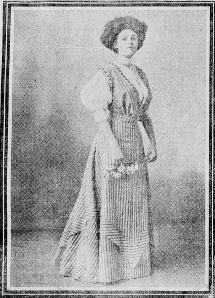
PRACTICAL FROCK OF LIGHTWEIGHT SERGE.