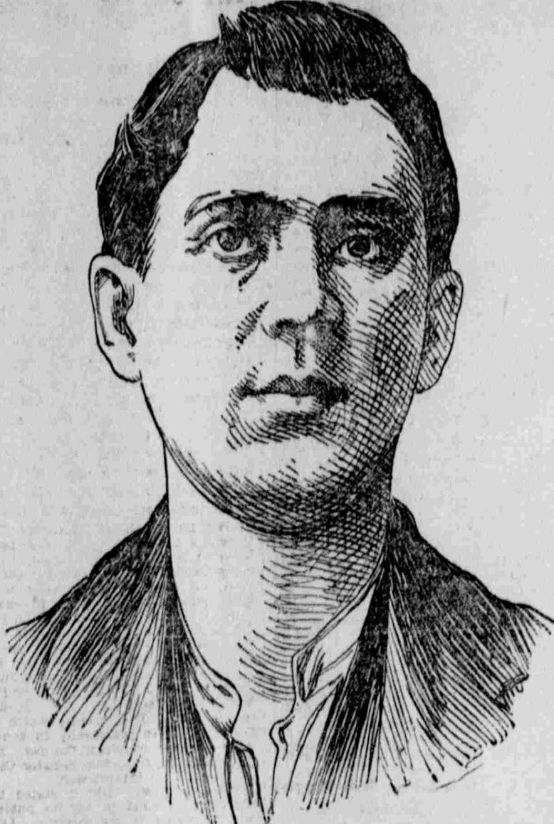
LEON CZOLGOSZ, THE WOULD BE ASSASSIN.