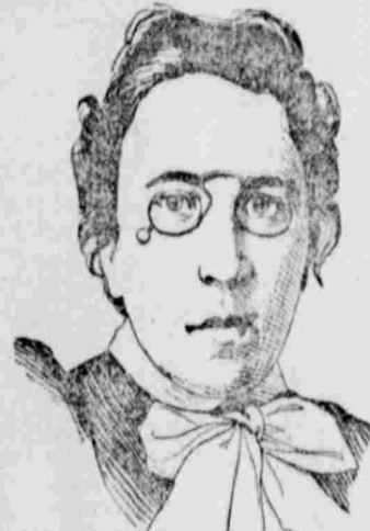
EMMA GOLDMAN. (Czolgosz says her teaching led him to try to kill the president.)