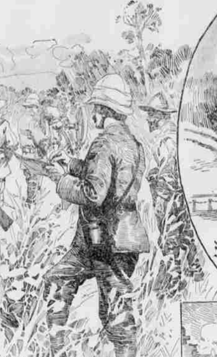
AT THE FRONT AT SAN JUAN.