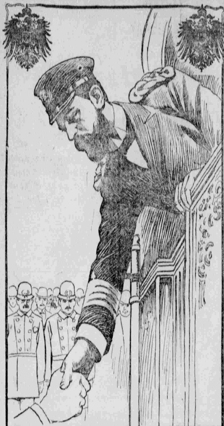
PRINCE HENRY'S HEARTY DEMOCRATIC HANDSHAKE.

The National Zeitung says that Prince Henry and the Americans have become better acquainted.