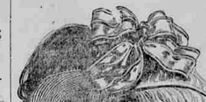
THE NEW RENAISSANCE HAT. The hat is very elegant and is made of the finest materials...