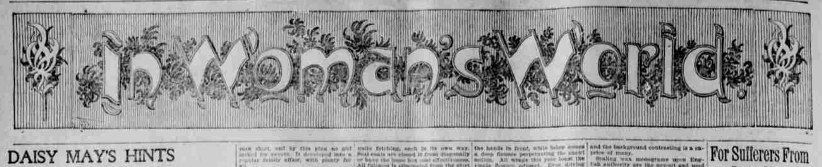
DESERET EVENING NEWS: SATURDAY, DECEMBER 3, 1898.