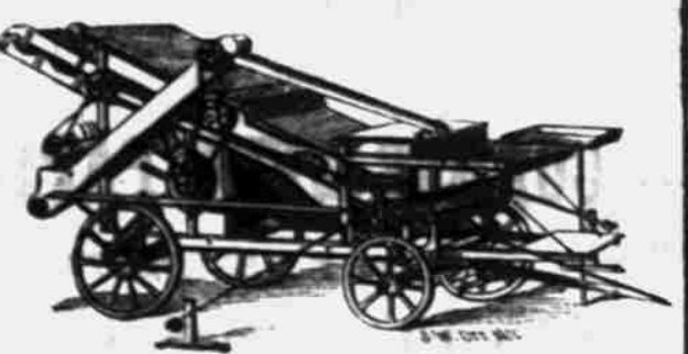
Double Fan Three-Hitch Gear

The success achieved by this machine during the past season is without a parallel.