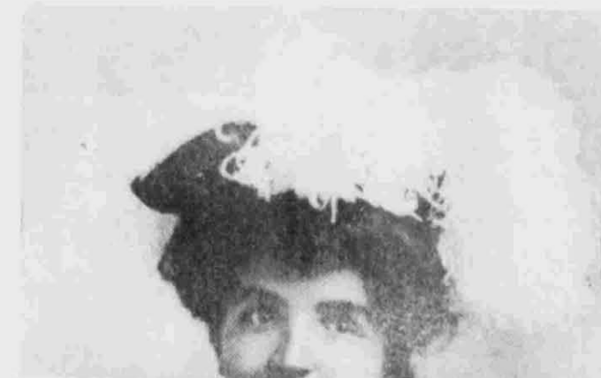
Exquisite Lieben- stein model, white and black, with gorgeous white os- trich feathers, $40.00.