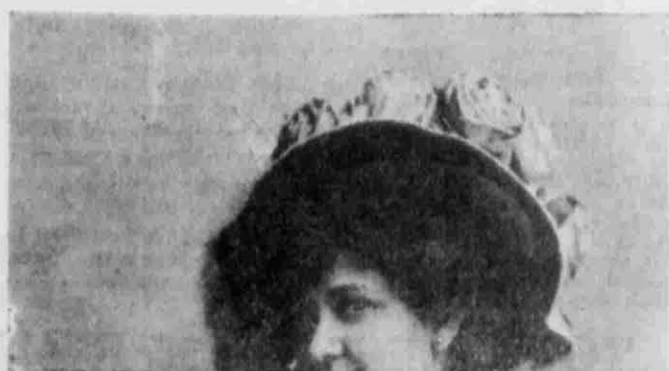
A smart model of pink felt with black velvet fac- ing with a gor- geous pink plume and new shaded ribbons, $25.00.