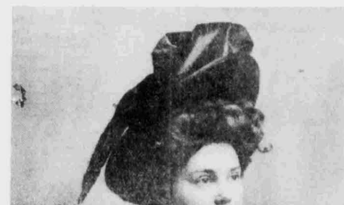
Nobby street hat, felt, handsome wing and pom pom of velvet, $7.50.