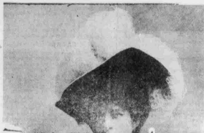
Handsome model, white mottle faced in black velvet and trimmed with elegant white plum- es, $45.00.