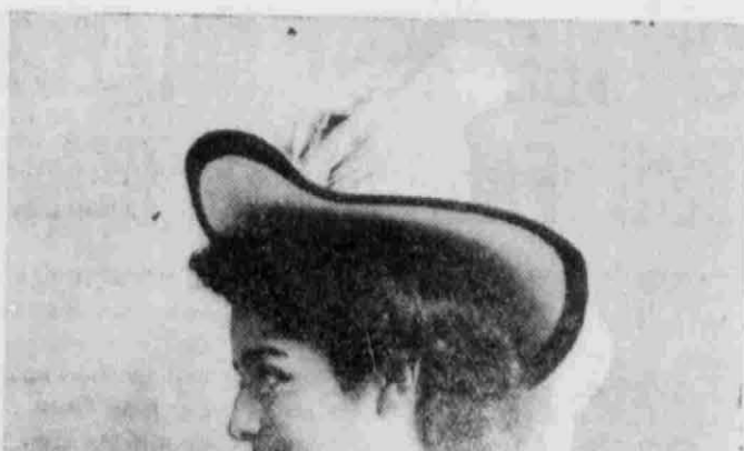
Misses' white and black fancy white wing and chiffon scarf, $12.00.