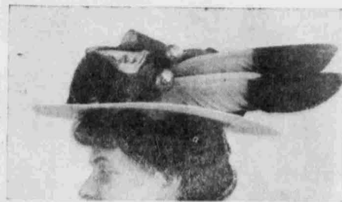
Smart large sail- or, champagne col- or, full bow trim- ming on the crown with shaded quills finished with two fancy stick pins, $14.00.