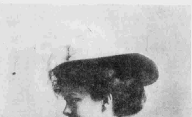
Soft white felt street hat, trim- ming of white leather pom-poms, with crushed white satin bands around crown, $30.00.