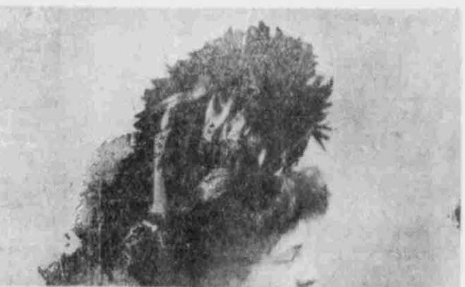
Champagne street hat with a full trimming of black and green shaded ecru feathers, $18.50.