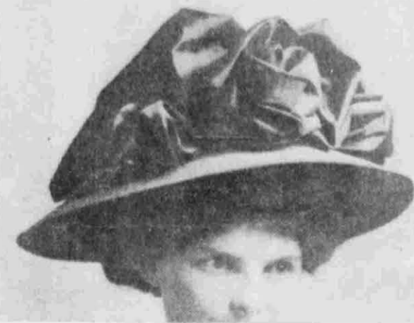
Large mushroom hat so popular in the east, full shaded pom pom, of silk. One of the most correct modes $20.00.