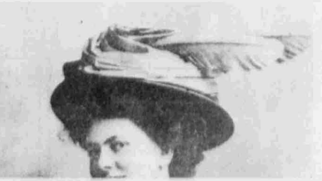
Smart street hat, sapphire blue, with full draped trim- ming of soft lib- erry satin with handsome quills, $22.50.