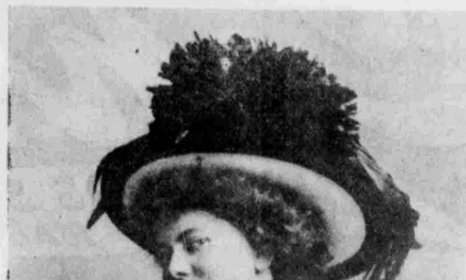
Handsome white and black street hat, black binding, full trimming, of shaded ecru feathers and pom-poms, $18.50.