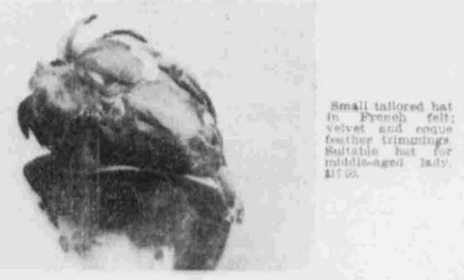
Small tailored hat in Pyrene felt, velvet and ecru feather trimmings. Suitable hat for middle-aged lady, $17.00.