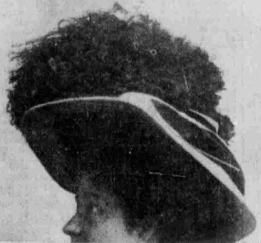
Georgette model, champagne color, with green velvet facing, with immense ostrich feather pom pom, and und handsome drapery around crown, with a dash of Persian, $50.00.

The newest ideas in refined millinery are those where the brims are largely an accentua- tion of the mushroom shape, sloping away from just above the brow in broad sweeping lines, admirably suited to the new modish coiffures.