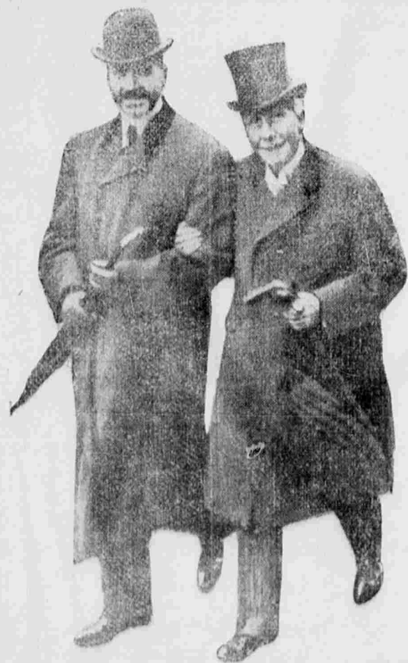
JOHN D. ROCKEFELLER AND HIS GUARD.