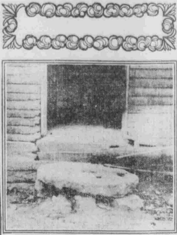
THE OLD MILLSTONE