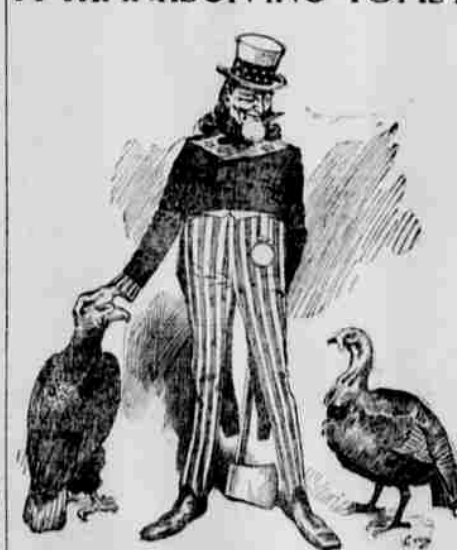
UNCLE SAM: "Here's to my birds—the Bird of Freedom and the Bird of Food!"

Chinese gas through inflammable petroleum water-jackets of iron or copper are placed around the engine, the water in the jackets being in the heat and discharging the heat into the air.