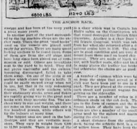
THE ANCHOR BACK.

side of each gun is painted in large white letters, "Taken from H. M. S. Hoodman by the United States Navy, Oct. 10, 1917." These guns have been in the navy yard for many years and are one of the principal collections of old war relics.