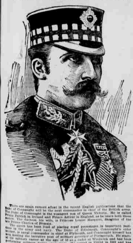
THE DUK OF CONNAUGHT.

There are again rumors about the recent English publications that the Duke of Connaught will be the next commander in chief of the British army. The Duke of Connaught is the youngest son of Queen Victoria. He is called Prince Patrick in Ireland and Prince Arthur in England, as he bears both those names. The duke's wife, is Princess Louise Margaret, daughter of the late Prince Charles of Prussia.