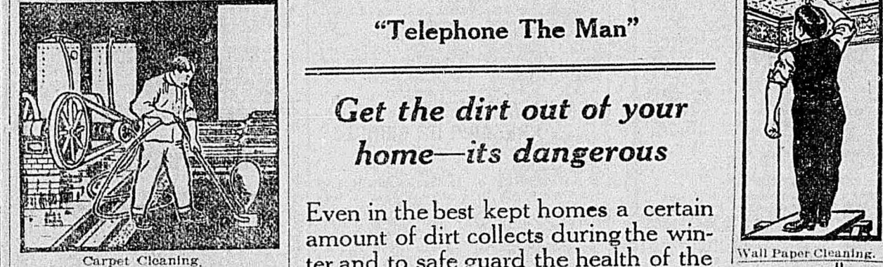
Carpet Cleaning. Wall Paper Cleaning.