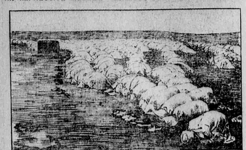
The picture shows a very impressive religious ceremony which is held in the outskirts of the holy city of Biskara, in Algeria, on the border of the Sahara. It is performed by hundreds of white-robed Arabs, who follow the strictest Moslem ritual. The earlier part of the service is recited standing, but at a certain point the whole great assembly falls prostrate.