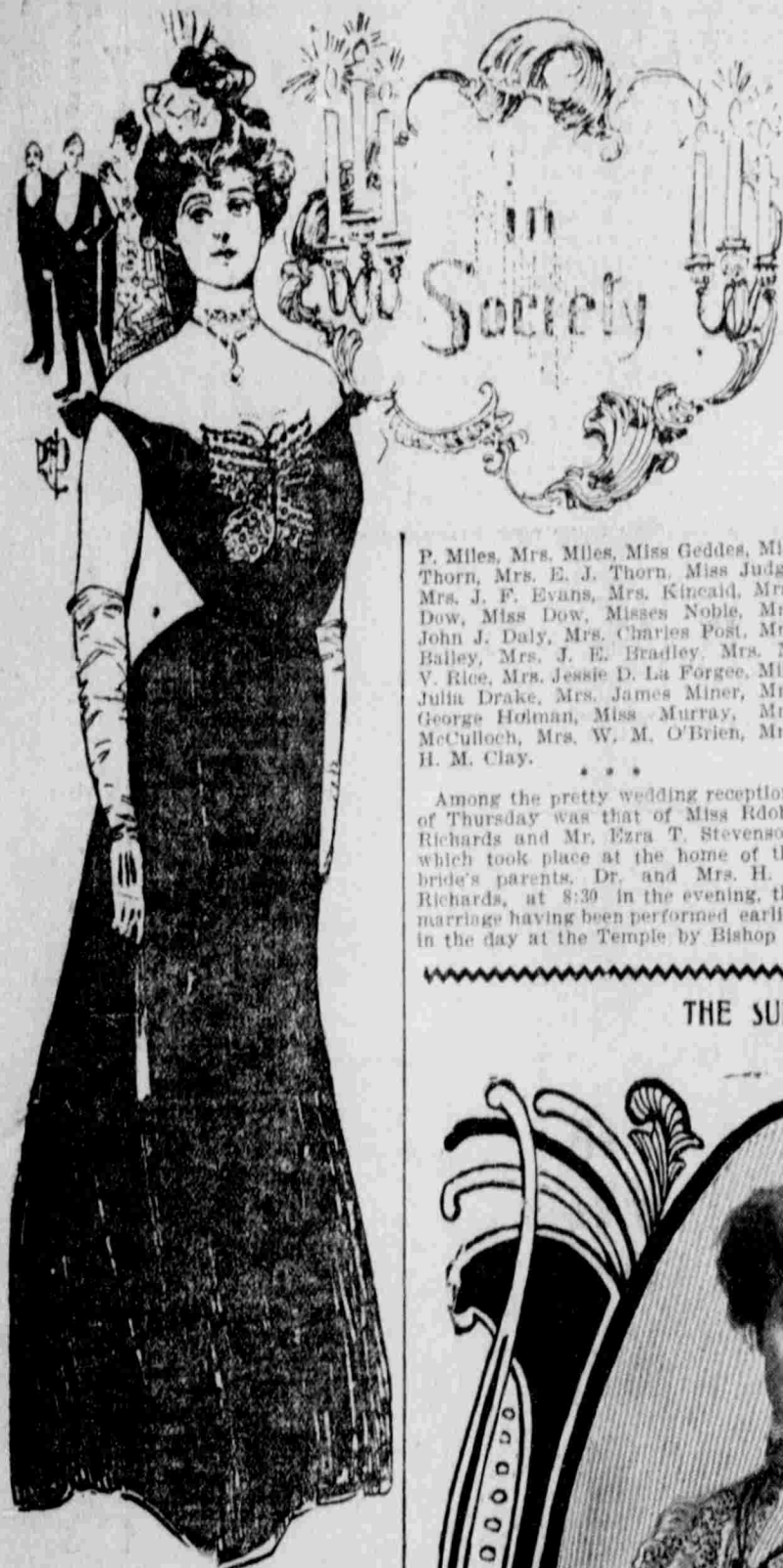
THE SUMMER GIRL.

Saltair, the Lagoon and the Salt Palace have monopolized the larger portion of social attention during the week, the warm weather making a trip to the comparative coolness of these suburban retreats a refreshing change for those still remaining in the city. Street car rides after sundown are immensely popular, a large number of people alone, in parties or couples being seen each evening enjoying the fresh breezes to be gained in the rides on the suburban routes. The Fort Douglas ride has always been a popular one, and the reduced fare has had the effect of making daily Fort tourists of a large number of people who choose the ride for a pleasant evening's outing. Notwithstanding the unusually warm weather Salt Lake is exceptionally favored in having the advantage of the near retreats, where cool breezes are wandering within a few minutes' ride.