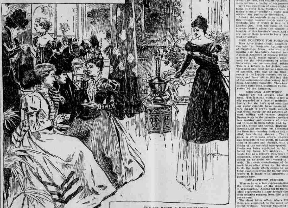
THE TEA PARTY, A FAD OF FASHION

For Shining Boots. A simple recipe for shining boots quickly is to rub them with a slice of orange. Let the juice dry in and then polish with a soft brush. For leather boots a towel is used to remove the polish. For brown boots and almost the following paste will be found useful: