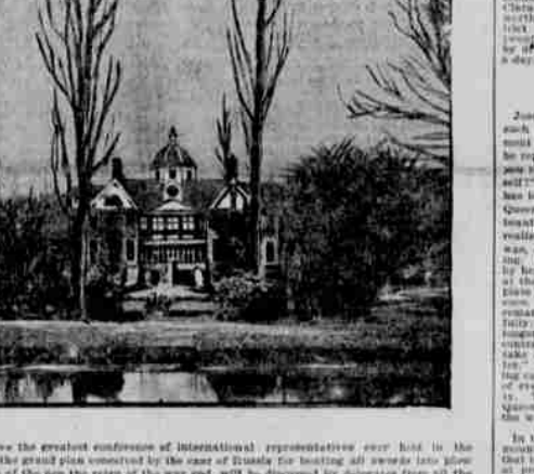
The building where the peace conference is being held.

The building where the peace conference is being held is a grand structure with a large dome. It is located in a city with a rich history.