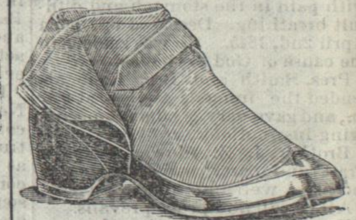
Snow Excluder Open.

Showing how the snow and water are excluded.