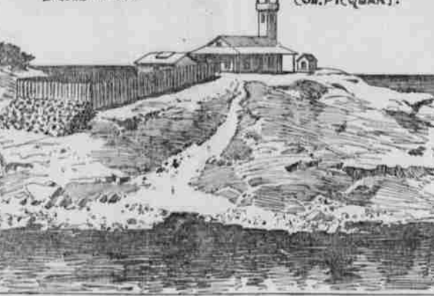
TWO MEN WHO HAVE AIDED DREYFUS AND HIS DEVIL'S ISLAND PRISON.

Captain Dreyfus, who is now in prison on Devil's Island, was a great deal of trouble to the French government. He was accused of being a spy, and was sentenced to life in prison. Two men, Emile Zola and Col. Picquart, have aided Dreyfus in his fight for freedom. Zola wrote a famous article in 1896, in which he accused the French government of a cover-up. Picquart was a military officer who had evidence that Dreyfus was innocent.