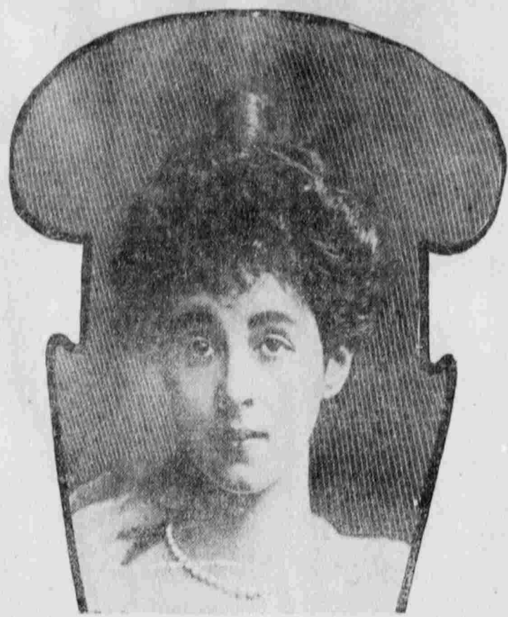
The marriage of Consuela Vanderbilt to the ninth Duke of Marlborough was hailed as a real love affair. Yet the "rift in the life" has come and the open breach between them is the comment of London society.