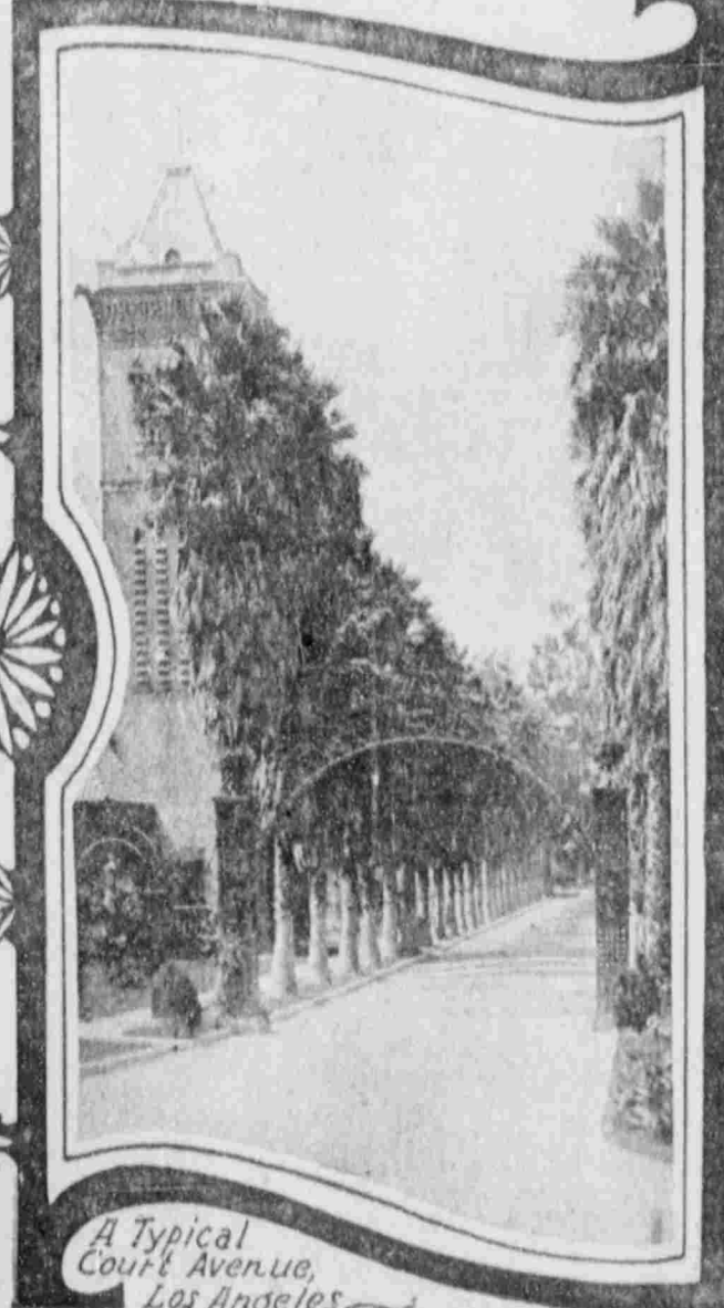
A Typical Court Avenue, Los Angeles