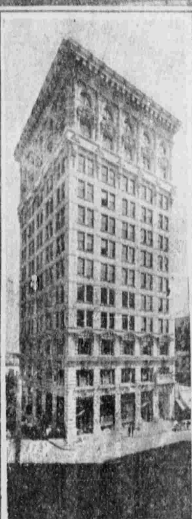
The Braly Block, Los Angeles Skyscraper