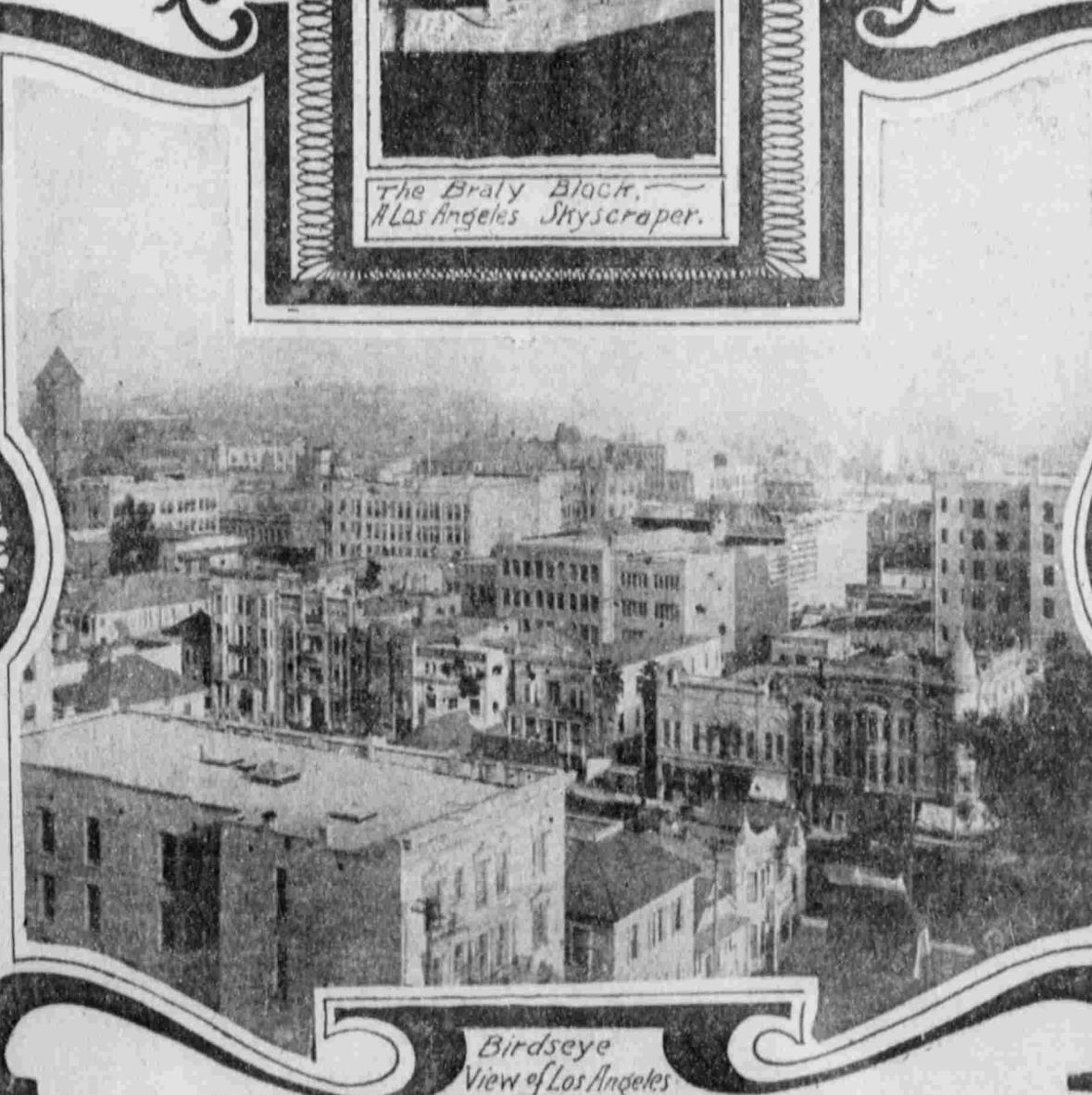
Birdseye View of Los Angeles Business Section