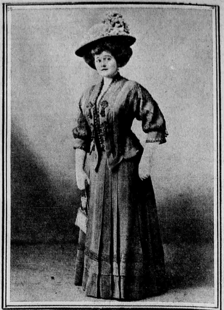
VOILE ELABORATELY BRAIDED.

As a material for tailored costumes of dressy persuasion, voile is finding much use among the higher class models. Its best skirt development is the pleated model simply trimmed with bandings or tucks. If the coat is trimmed, as it is in this instance, with handsome embroideries accomplished with soutache applied on satin, the skirt is elaborated with a matching band. Coats are of waist or hip length, and more or less elaborate with short sleeves and pretty vests, into which is often introduced a contrasting color. Taupe is the shade of this suit, with self-colored trimming, and a taupe straw hat in Babette model is trimmed with plisse Val and violets.