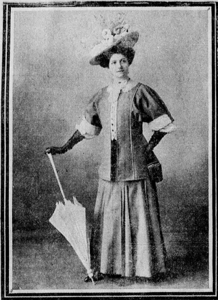
MOHAIR SHOPPING SUIT FOR SPRING.