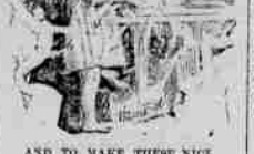
AND TO MAKE THESE NEW LIGHT CAKES AND BUNS SHOULD USE

Children enjoyed the baking day very much.