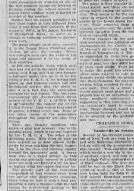
THE CHAMPION BASKET BALL TEAM.

The stories of the stage are full of interest and excitement. They tell of the triumphs and defeats of the actors and actresses, and of the lives of the people who work behind the scenes.