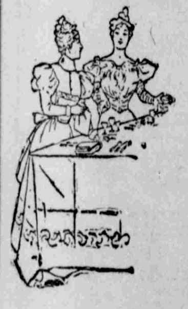
Table Linens, Entire Stock 16<sup>2</sup> Off.

Plenty of the extra size garments for very stout figures are here this season. More than we've ever eliun ii