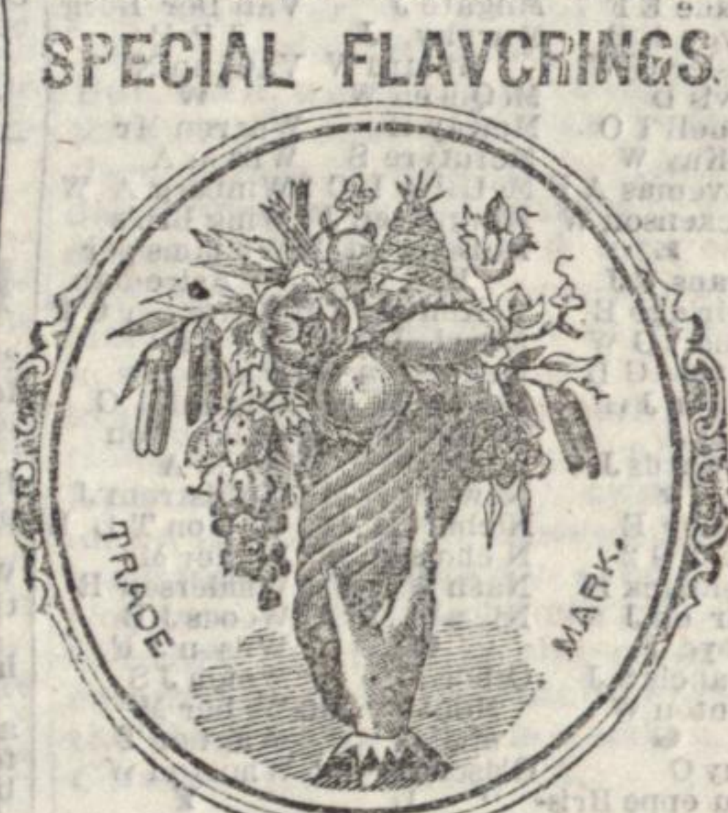
VANILLA, LEMON, ETC.,