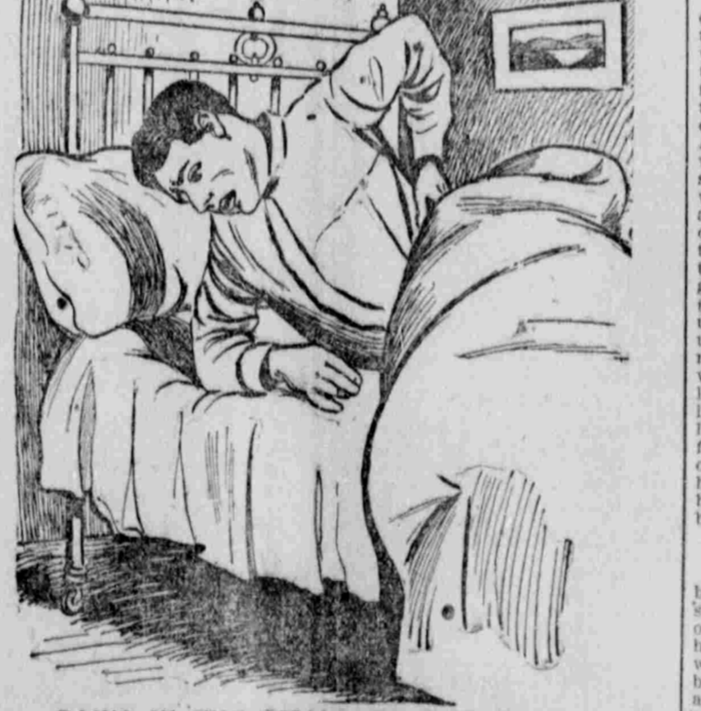
PAINS IN THE SMALL OF THE BACK.

Thousands of Men and Women Have Kidney Disease and Do Not Know Until It Has Developed Into Bladder Trouble, Rheumatism, Diabetes or Bright's Disease, Which Will Prove Fatal If Not Attended To At Once.