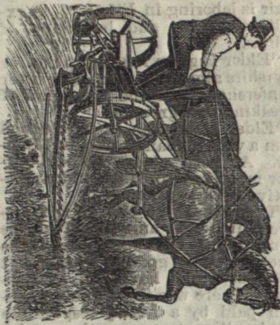
Mower at Work.