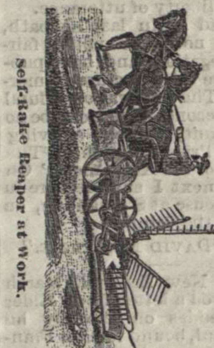
Self-Rake Reaper at Work.