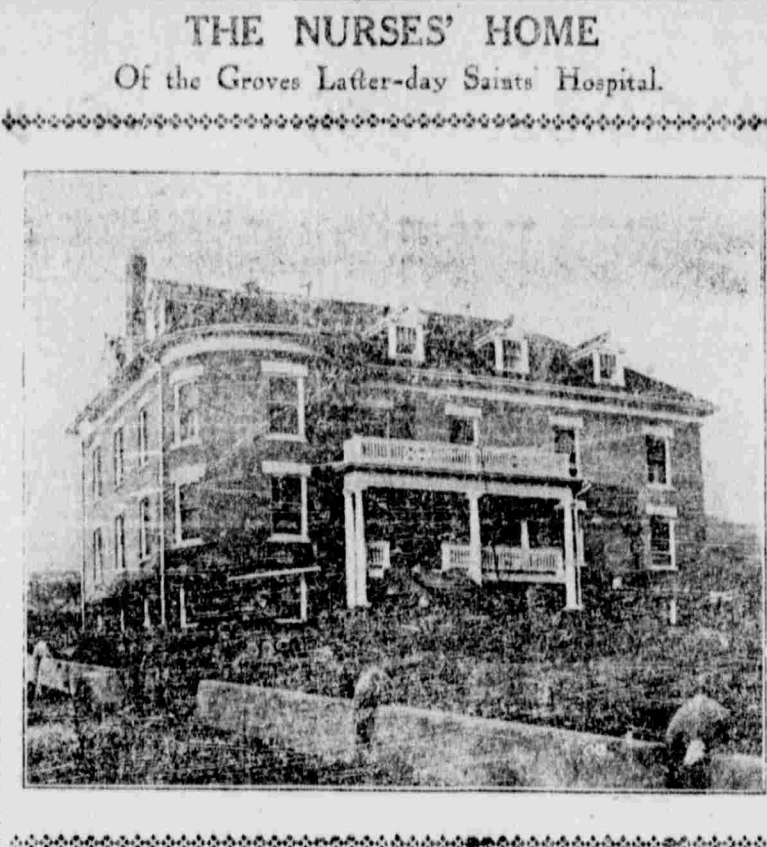
THE NURSES' HOME