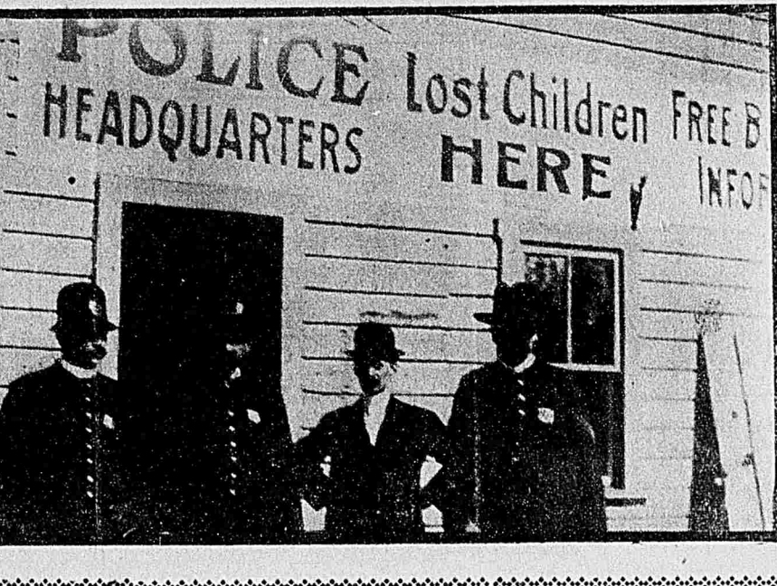
Four Foster Fathers Pose for the Camera