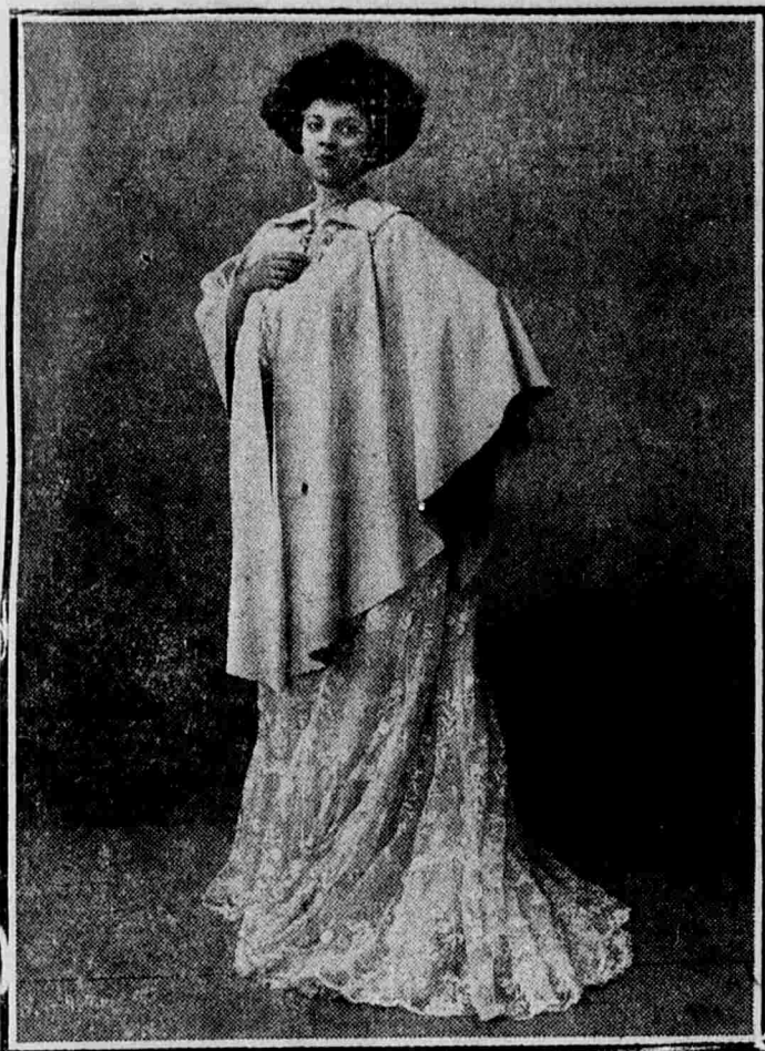
SUMMER EVENING WRAPS ARE SEVERELY SIMPLE.

"Tell you about Irish lace?" said old Mrs. Moran. O'Halloran, lifting her pretty wild-apple old face from her panel of rosepoint. "Sure, 'tis none can tell you better, for wasn't it my own grandmother on my father's side that worked the first bit of Carrickmacross lace ever made in this country?" And my own mother in the bitter years of the famine was the first woman in Ireland to set her needle in flatpoint lace, whatever the neighbors may say ag'in 't.