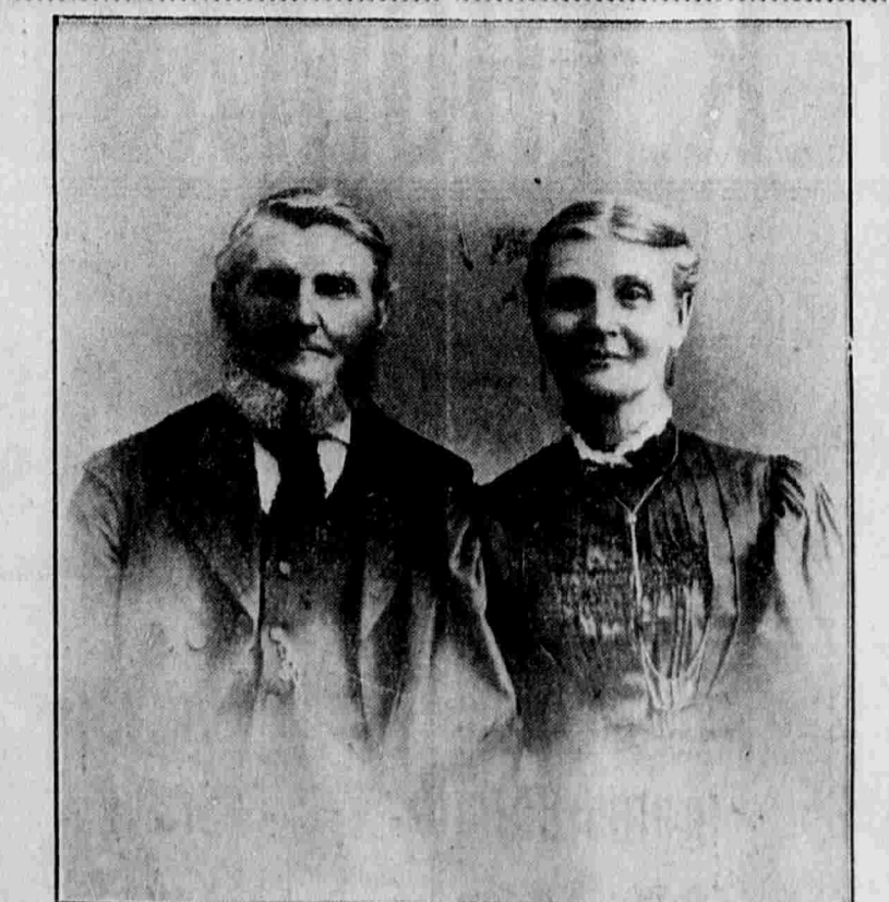
CELEBRATE THEIR GOLDEN WEDDING.

"Limerick is made on net like Carrickmacross, and there's two kinds."