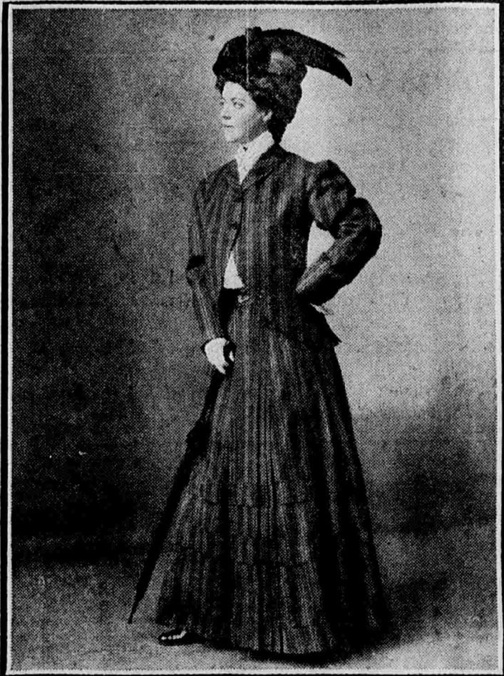
NATTY RUNABOUT SUITS.

DRUEHL & FRANKEN, DRUGGISTS, Also SMITH DRUG CO., Salt Lake City, Utah.