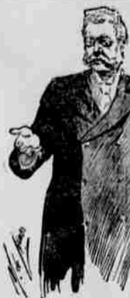
THE PEACEFUL MAN OF EUROPE.

M. Jules Cambon is, as we would expect, a very able diplomat. He is a very able diplomat, and his predictions are very accurate. The ground hog is a very reliable weather prophet, and his predictions are very accurate.