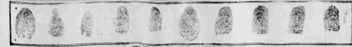
THE FINEST PRINTS OF PROGRESSIVE MODERNITY.

The ground hog is a very reliable weather prophet, and his predictions are very accurate. The ground hog is a very reliable weather prophet, and his predictions are very accurate.