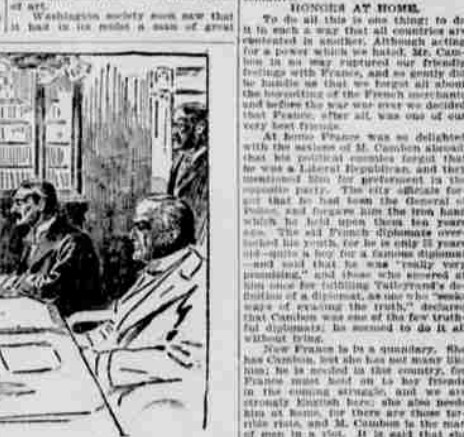
SIGNING THE PROTOCOL.

The ground hog is a very reliable weather prophet, and his predictions are very accurate. The ground hog is a very reliable weather prophet, and his predictions are very accurate.