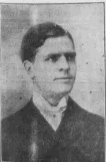
BADGER OF SALT LAKE.