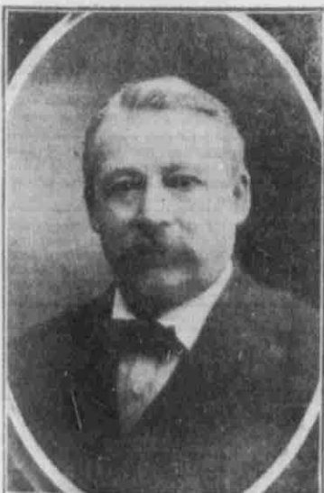
SEELY OF SANPETE.