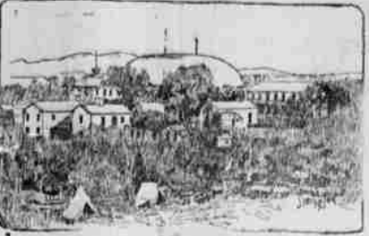
YIEW ON BEDADWAY OF YEARS AGO.