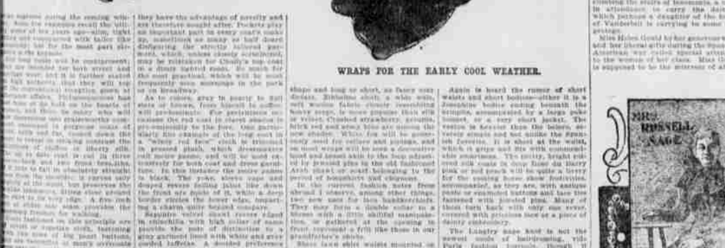
may be the most convincing. The following briefly indicates the changes in

that will get us between the interaction in the teeth. They are similar to the teeth of a comb. The best brushes have long bristles that are slightly curved. These are also called "split bristles." The ends to be spread apart on the back teeth. The greater proportion of toothbrushes that are of this design are for children. English, or French, or French or the Royal Windsor, small products of toothbrushes may be such carrying them in because in manufacture in the lower, where they are made of these. In this country it is the custom of many dentists, particularly dentists, to use, which is termed an "interposition of" and by taking a stipulated quantity, their names and addresses are put on each tooth. Whether this is a good idea or not is doubtful. I should think that if the brushes are manufactured by well known firms it would be of benefit to a good tooth and to brush the same of the market. With any who wish their names and addresses on the brushes it would be a good idea to have that of the manufacturers who sell it. MARY MIT ROWLAND.