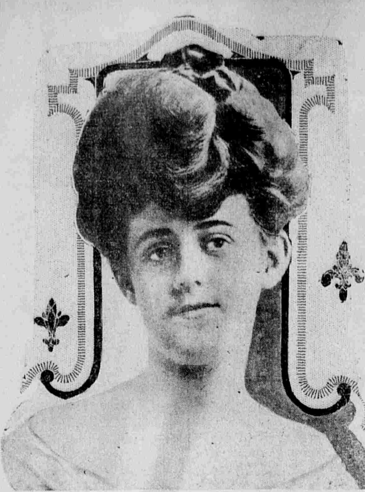
"SPIRITS" SAID TO WRITE LETTERS.

will resume instruction on GUITAR AND MANDOLIN July 1st, after two years of successful teaching in Los Angeles. Pupils should register immediately at Harrow Bros., Book Store, 322 So. Main St. Both phones.