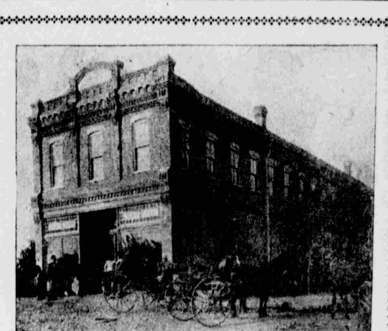
HYRUM NEILSON'S STORE, HOLLIDAY.

BAGLEY BROTHERS have successfully run a meat market here in Cottonwood for many years. They do a wholesale and retail trade, and operate their own slaughtering house. It is doubtful if any other market in the county outside of Salt Lake does as large a business. Their wagons cover all of Holliday and the neighboring districts, and their neat little home market