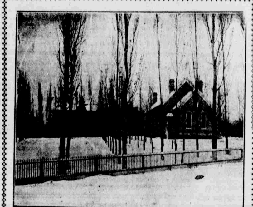
SCHOOL HOUSE AND MEETING HOUSE, HOLLIDAY.

SIX miles to the southeast of Salt Lake City, and two miles to the east of the city of Murray, at the base of the Wasatch mountains, away from the fumes of the smelters, and the smoke of the city, lies the lovely little village of Holliday. Its beauty is not surpassed in all of Salt Lake valley. The somewhat undulating country with its various elevations and many stately trees adds greatly to the scene. No matter from which direction the village is approached the presentation of the view