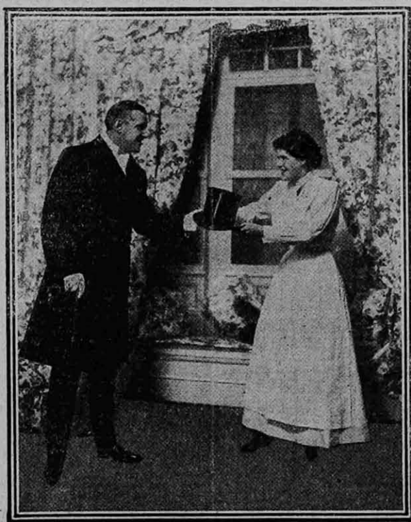
SCENE FROM "THE BACHELOR,"

In "The Top of the World," at the Salt Lake Theater, Friday and Saturday, December 17 and 18, With 5 Saturday Matinee.